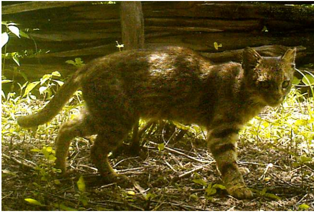
Pampas Cat Leopardus colocolo recorded on 2 March 2016 in seasonal dry forest, north-western Peru.