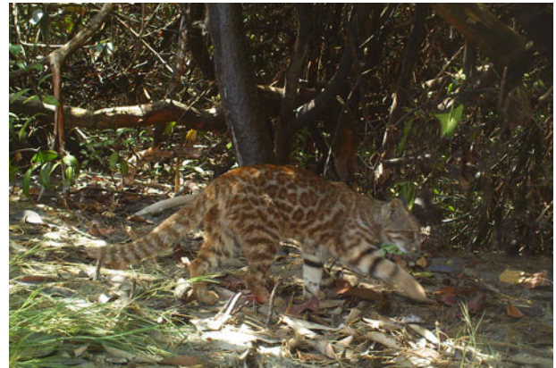
PLATE 1 Pampas cat Leopardus colocolo in San Pedro de Vice Mangrove, Peru.

During 2,277 camera-days we obtained 23 records of the Pampas cat, in six of the eight surveyed localities (Fig. 1; Plate 1). We also found one captured individual in Chapangos town, and interviews confirmed the species' presence in Yacila de Zamba Private Conservation Area. Additionally, we compiled five records from other researchers (E. Edavalay, P. Vásquez, K. Herrera, D. Tirira and M. Gómez; Fig. 1). Our updated distribution map includes 12 new records of the species: three in the Sechura Desert and nine in the dry forest. The lowest altitude at which the species was detected was 0 m, in San Pedro de Vice Mangrove, and the highest altitude was near Kuelap Archeological Site, at 2,210 m. San Pedro de Vice Mangrove was the